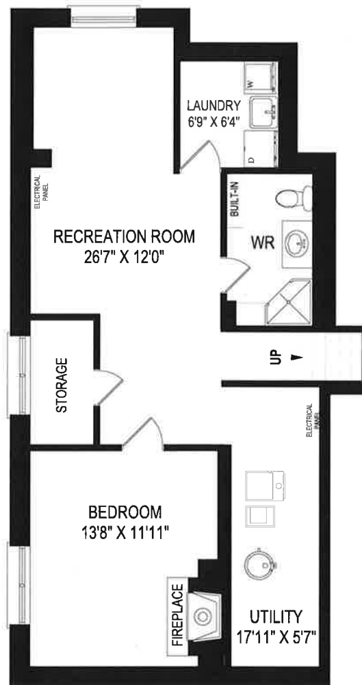
LOWER LEVEL 861 SQUARE FEET